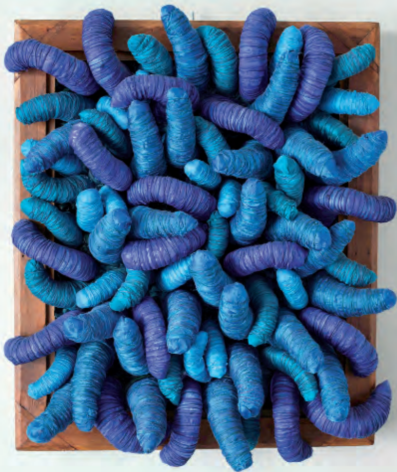
UNE PEUR BLEUE 2014 Mixed media: wood, textile, plaster 70x59x18cm