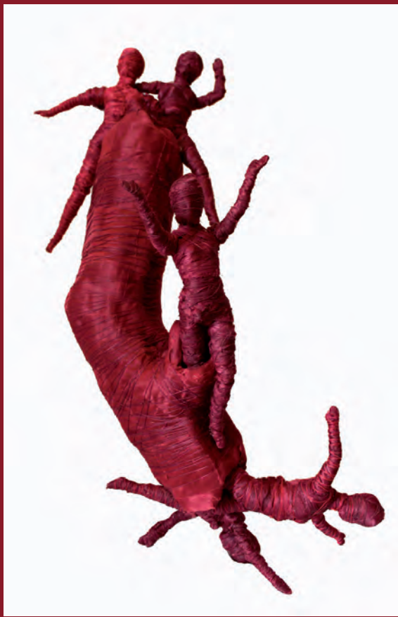
MES PETITES COLERES II 2015 Mixed media: wood, textile, toys 80x36x22cm