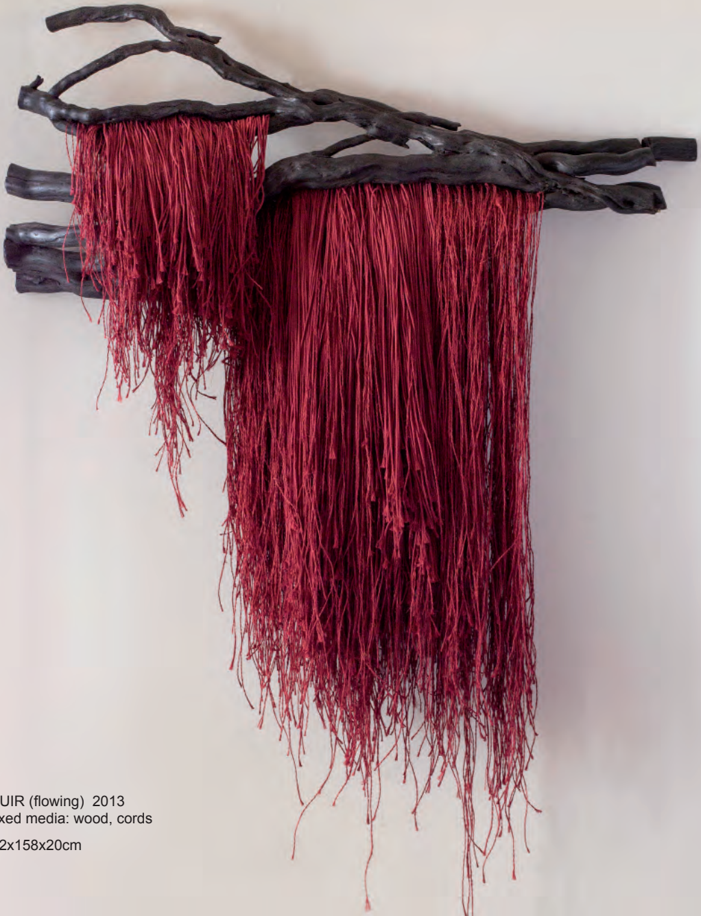
FLUIR (flowing) 2013 Mixed media: wood, cords 162x158x20cm