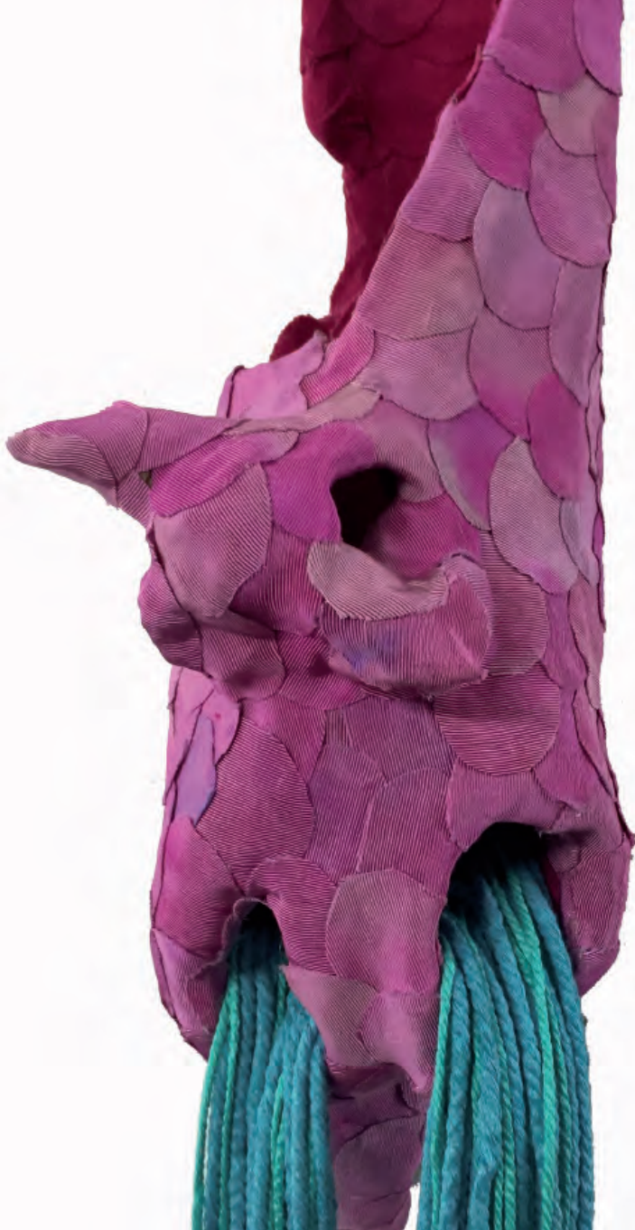
GARGOUILLE. (detail) 2016 Mixed media: wood, textile, cords 155x22x35cm