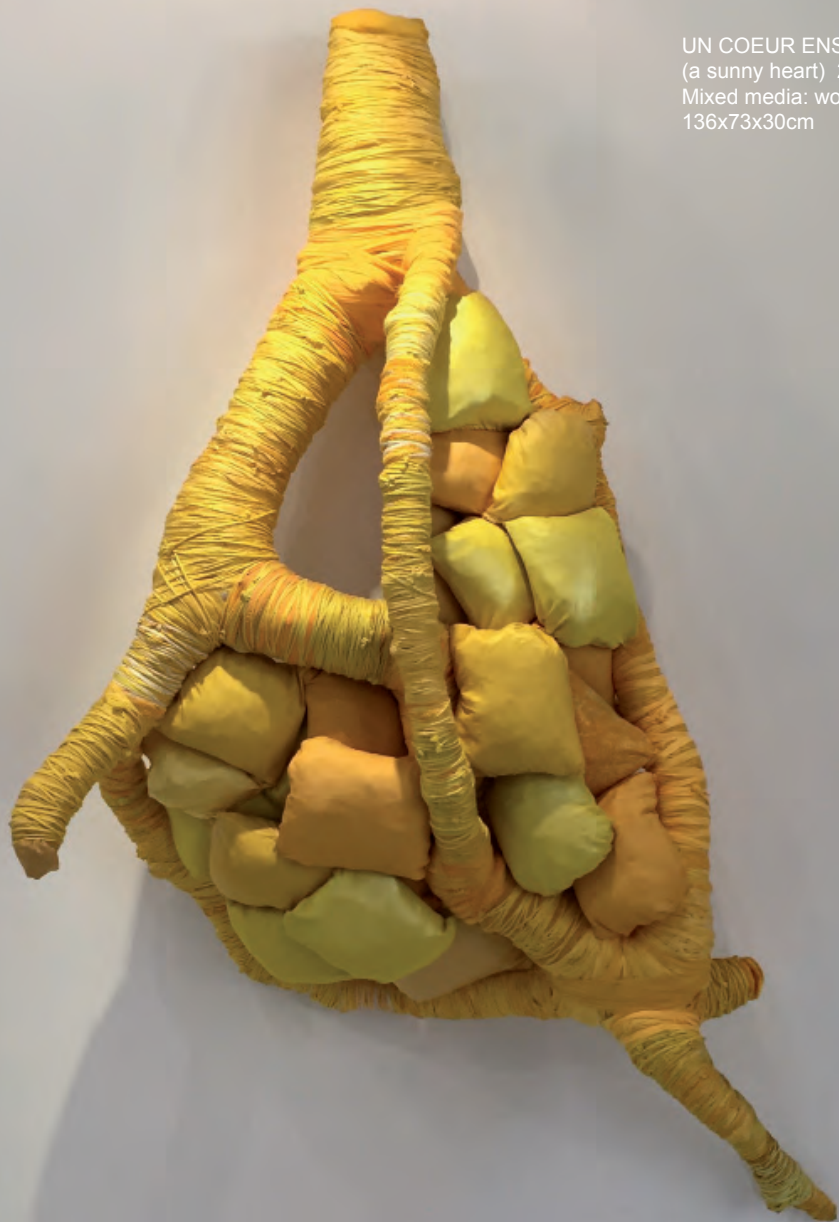
UN COEUR ENSOLEILLE (a sunny heart) 2015 Mixed media: wood, textile, cords 136x73x30cm