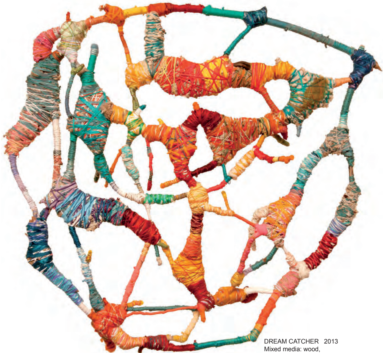
DREAM CATCHER 2013 Mixed media: wood, wool, textile, cords 178x194x40cm