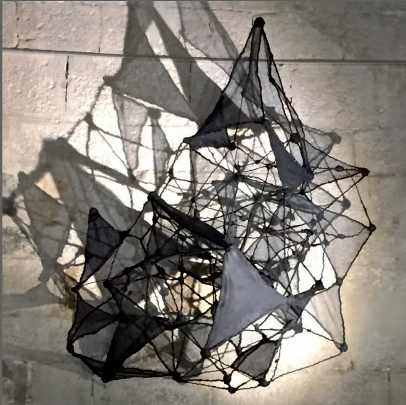
OPUS NIGRUM 2015 Mixed media: wire, textile, cords 145x136x59cm