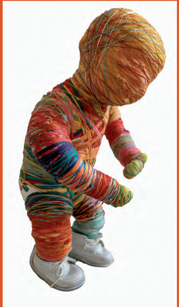
NEO 2013 Mixed media: puppet, textile, cords 52x30x26cm