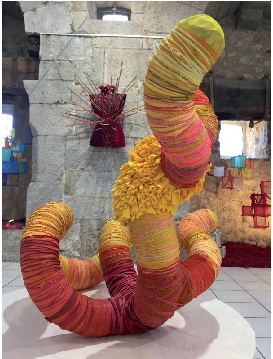
JE VEUX DU SOLEIL (I want sun) 2016 Mixed media: iron, textile, cords. 68x80x80cm.