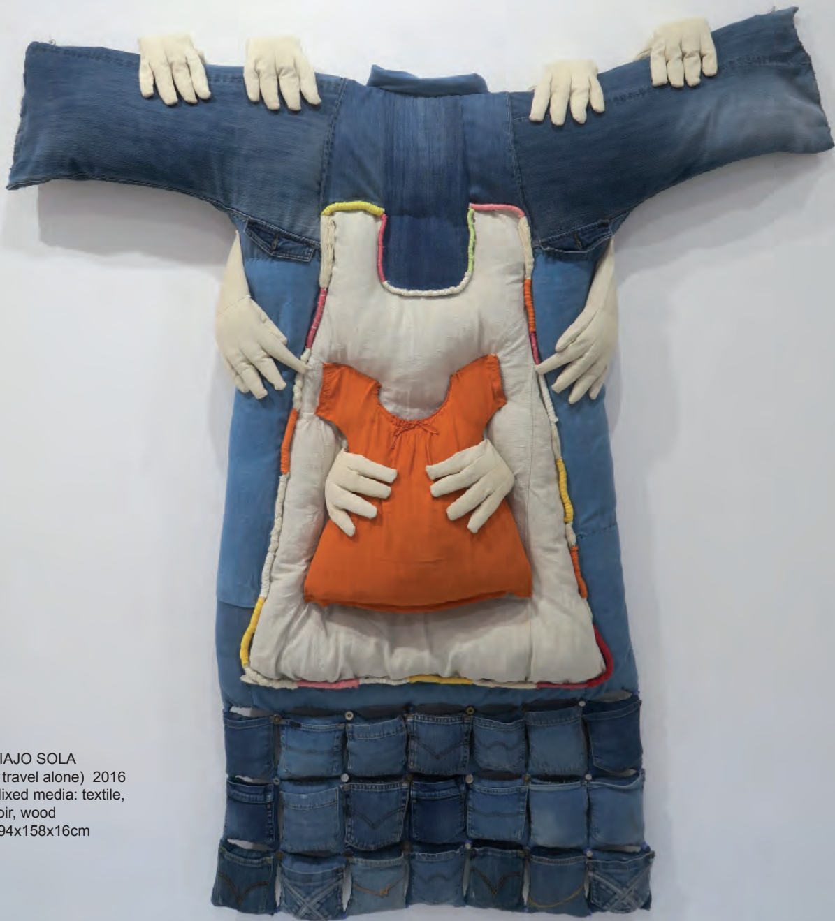
VIAJO SOLA (I travel alone) 2016 Mixed media: textile, coir, wood 194x158x16cm