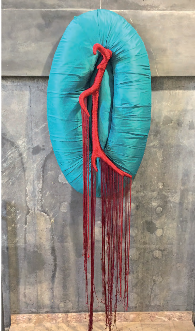
IN MEMORIAM 2016 Mixed media: iron, horn, textile, cords 250x74x34cm