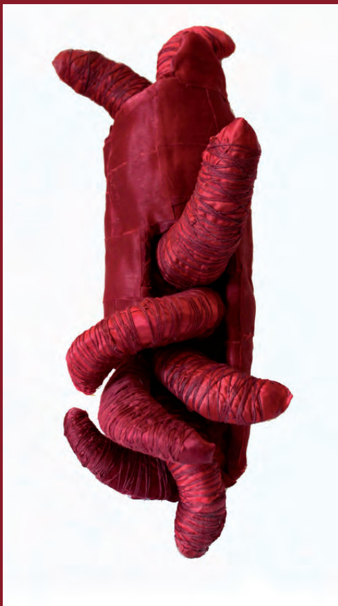
MES PETITES COLERES I 2015 Mixed media: wood, textile, plaster 56x23cm