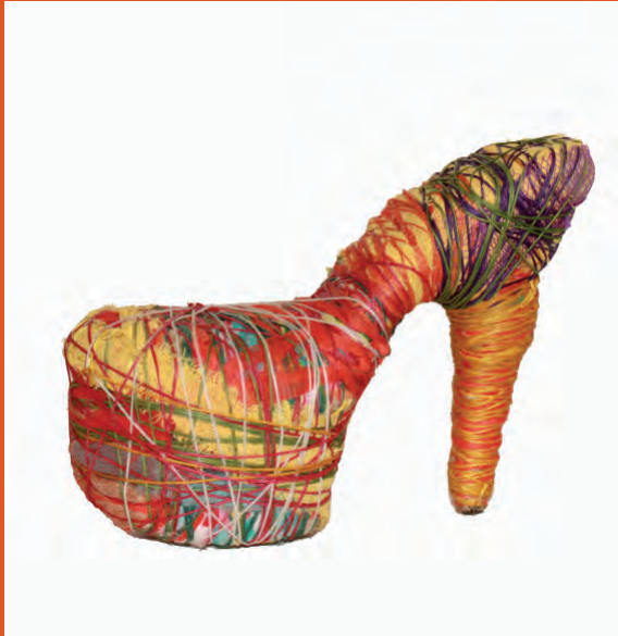
ATAME (tie me up) 2013 Mixed media: plastic, textile, cords 16x17x26cm