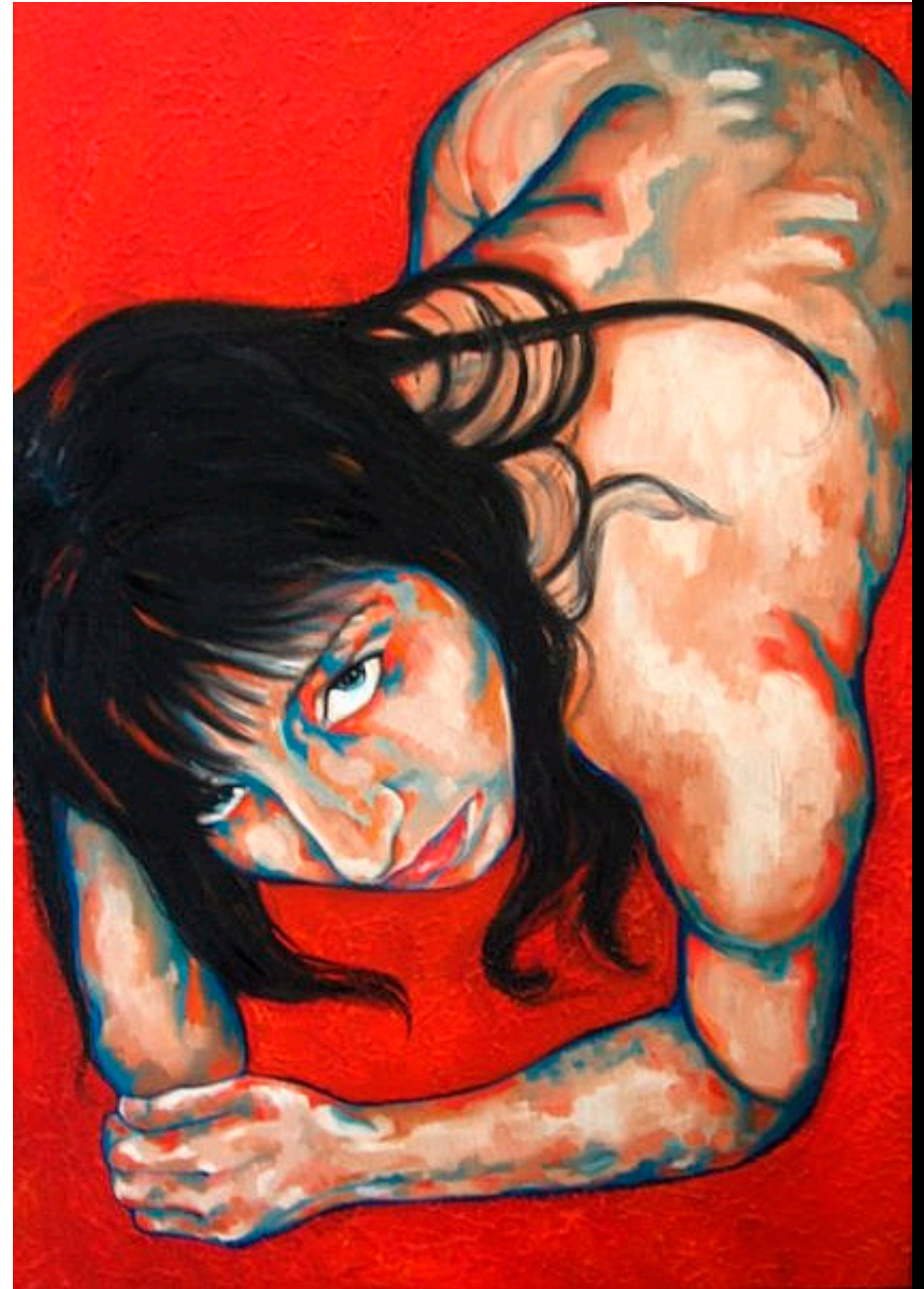
„Valeria I“, oil on canvas, 70x100 cm, 2007