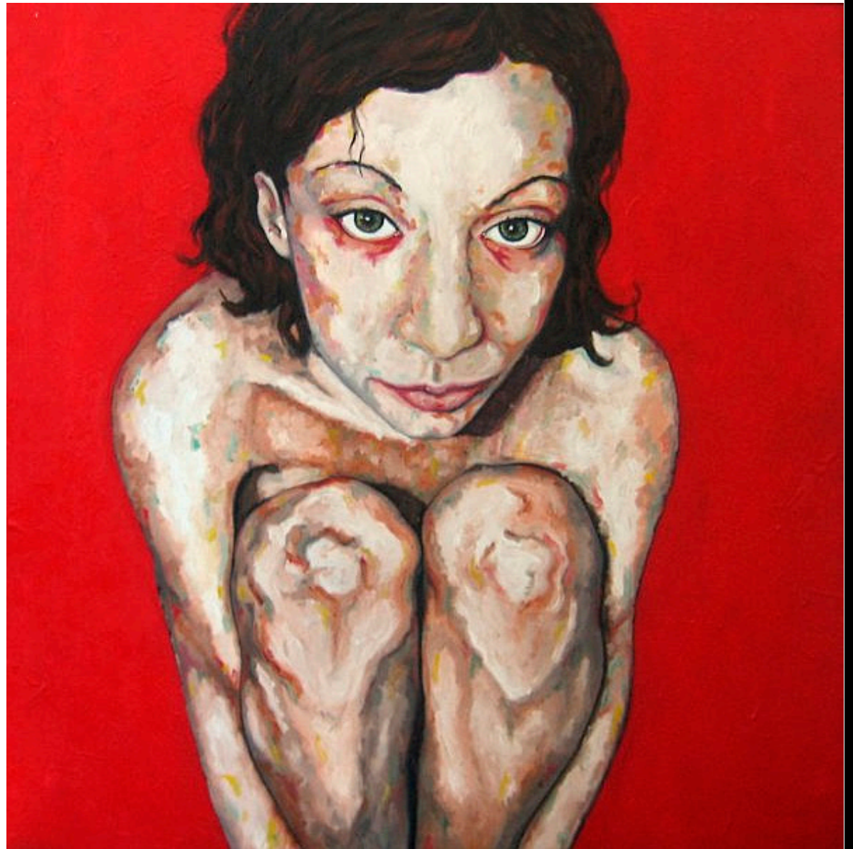
„Aurora I“, oil on canvas, 100x100 cm, 2005