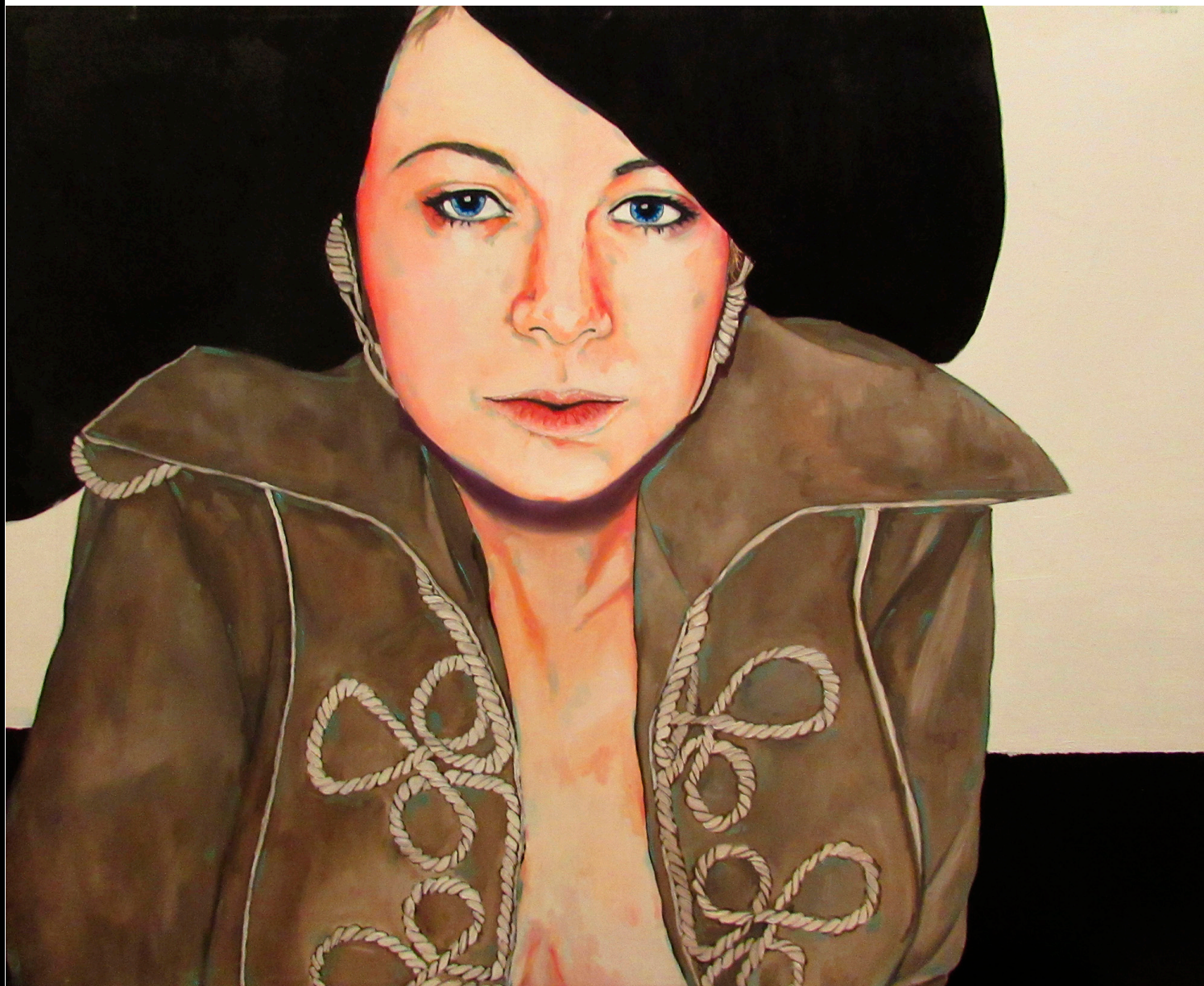
„Linda“ oil on canvas, 100x80 cm, 2010