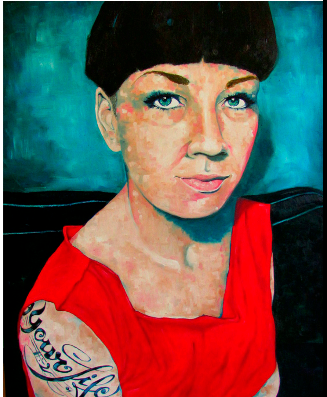
„Cherine “ oil on canvas, 80x100 cm, 2014