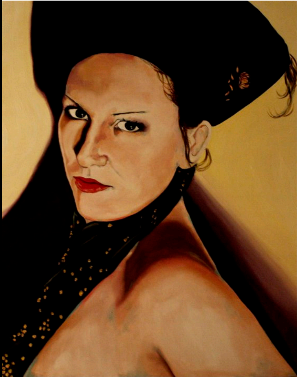
„Lady Balloon “ oil on canvas, 80x100 cm, 2011