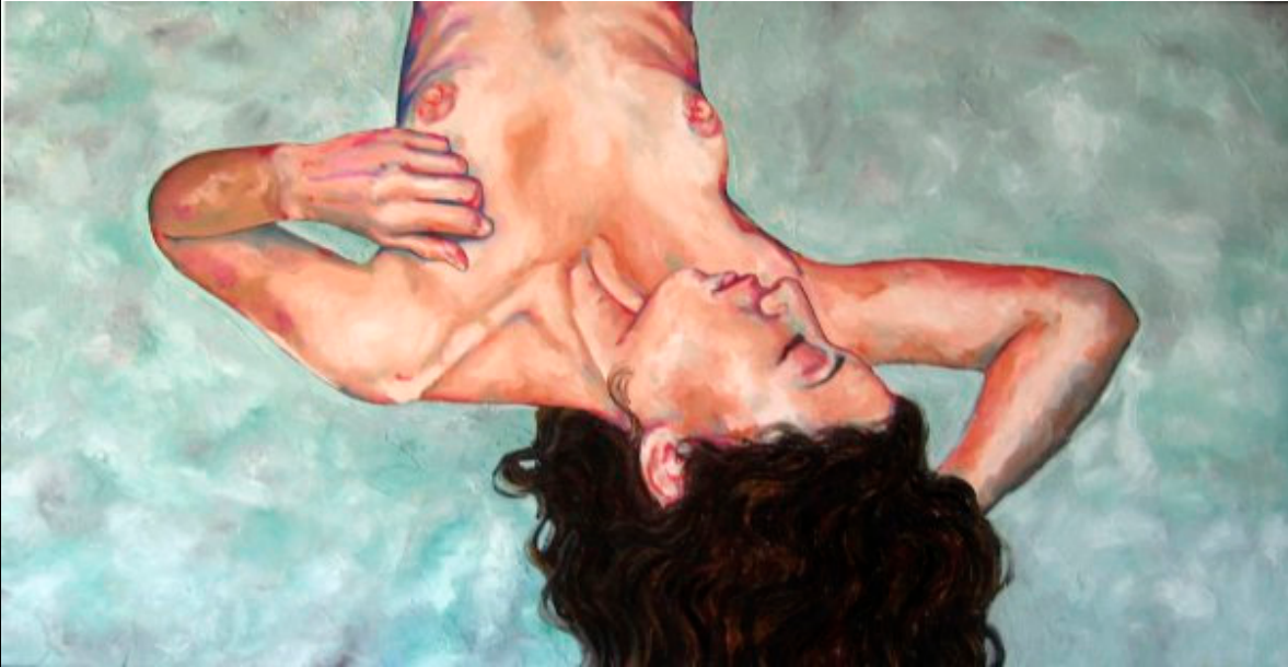
„ Aurora V“, oil on canvas, 50x100 cm, 2006