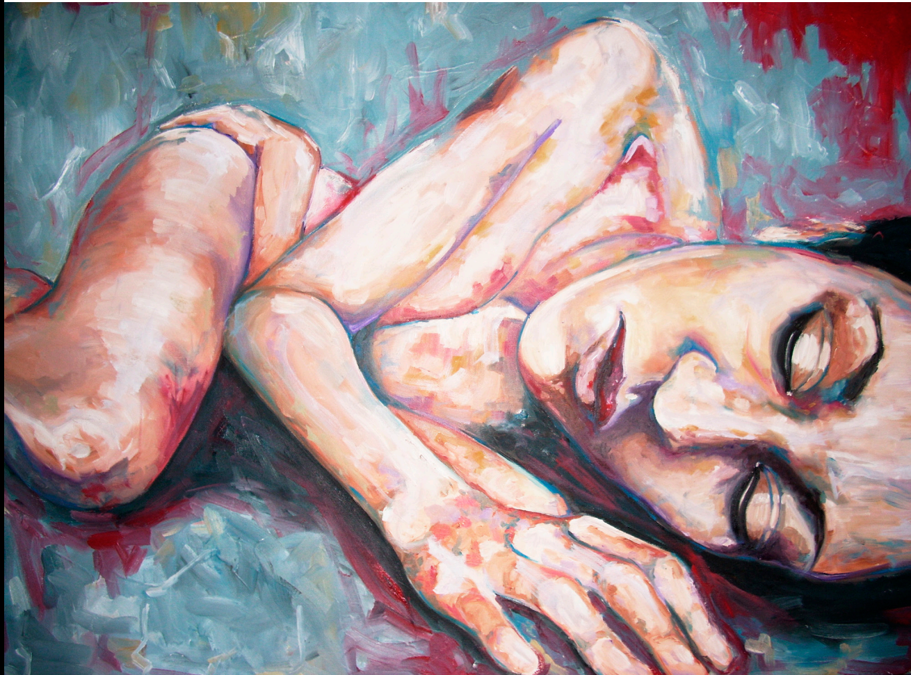
„Selfportrait“, oil on canvas, 100x70 cm, 2007