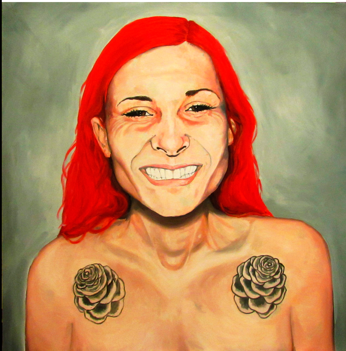
„The laughing Mankind - I“ Oil on canvas, 80x80 cm, 2011