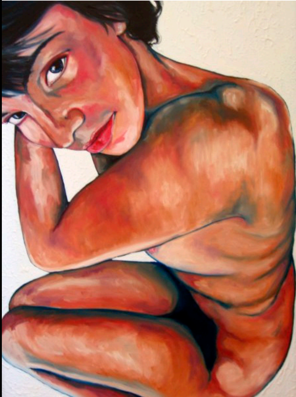
„Valeria II“, oil on canvas, 70x100 cm, 2007