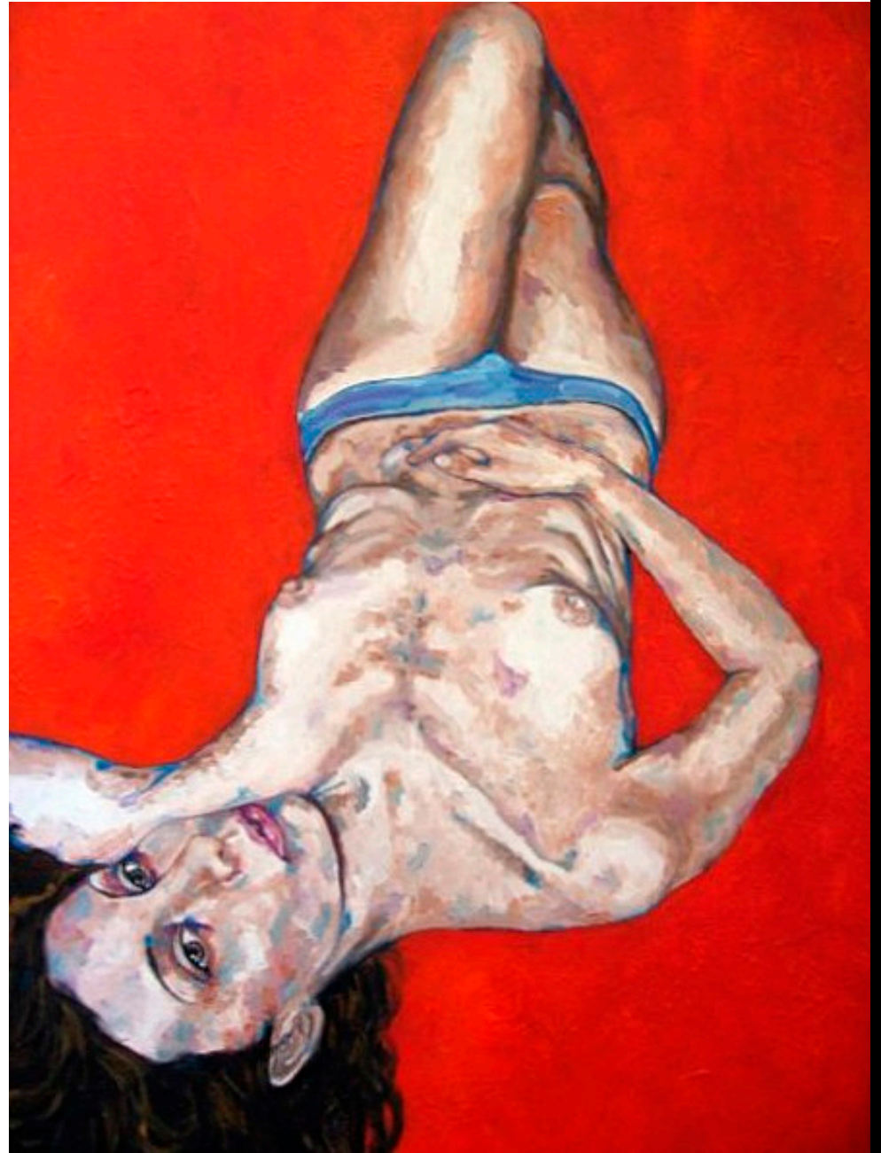
„Aurora II“, oil on canvas, 70x100 cm, 2005