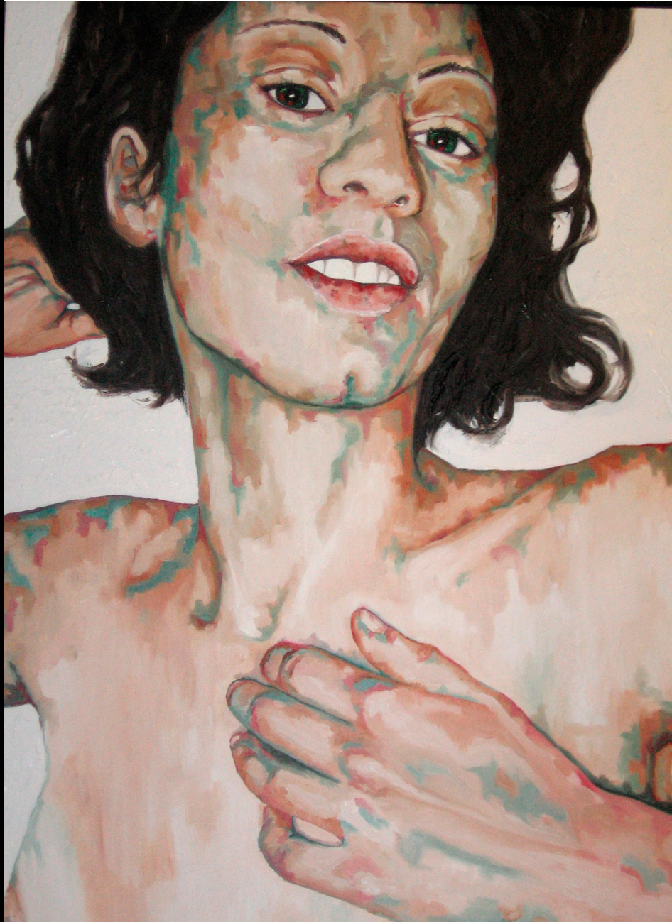
„Aurora III“, oil on canvas, 100x70 cm, 2005