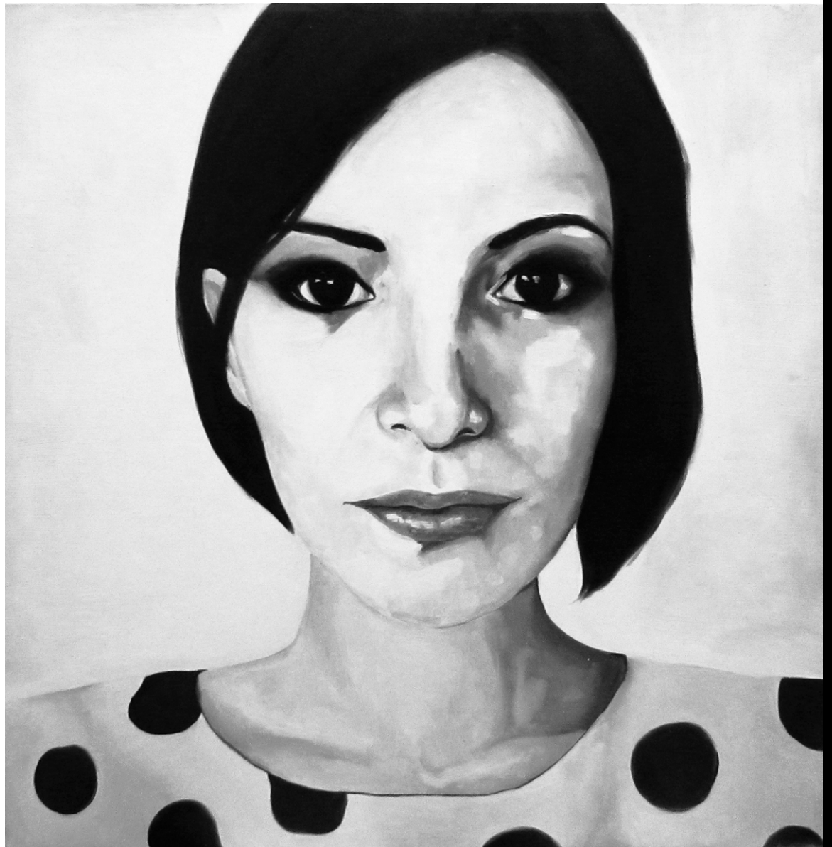
„The other side“ Oil on canvas, 80x80 cm, 2010