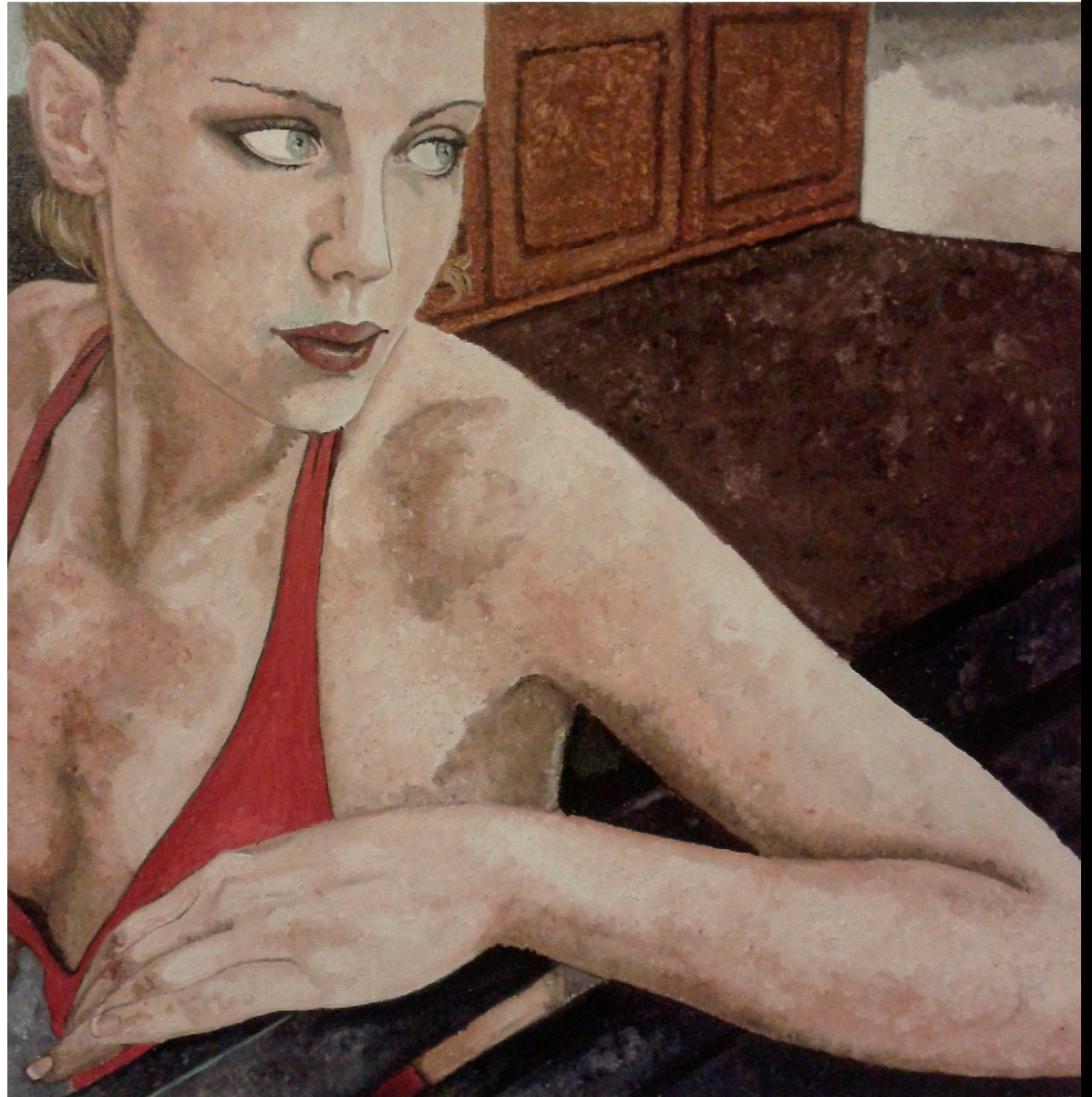
„Untitled“, oil on canvas, 40x40 cm, 2005