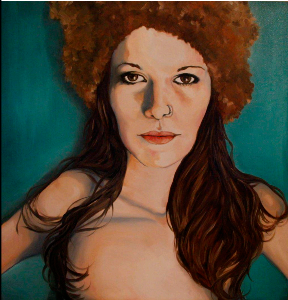
„The charming Mankind “ oil on canvas, 80x80 cm, 2012