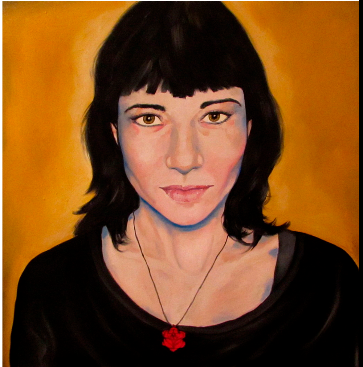
„The gazing Mankind “ oil on canvas, 80x80 cm, 2013