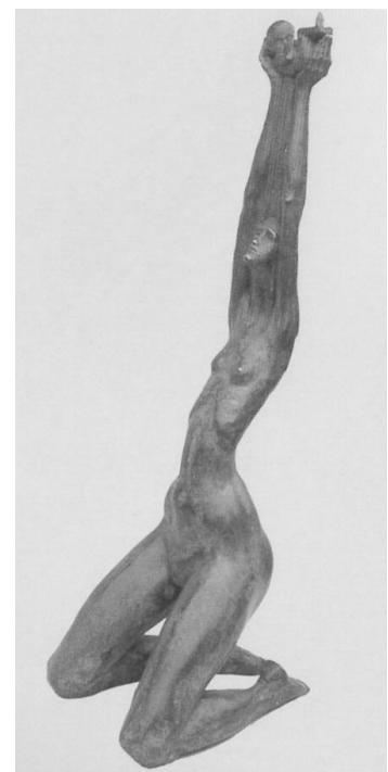
'Nature or hymn to Life', 1972

The strong connection to the myth, is shown by the classical "Leda and the Swan" by the various Nudes, by fauns, nymphs and tritons, all engaged in an eternal struggle between the Apollonian and the Dionysian. Not to be forgotten the call to the "Infernal Sabbath".