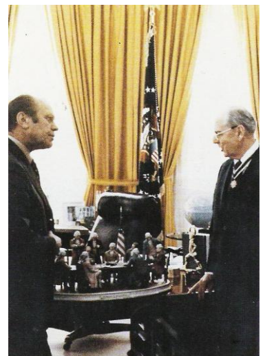
The US President, Gerard Ford, on his table the "Declaration of Independence", 1974