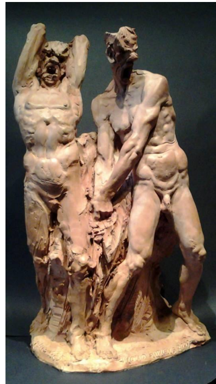
"Homo Sapiens 2000", 1982

Throughout his life he continued a spiritual and stylistic research on various subjects from the Greek-Roman-Christian tradition, revisited and re-actualized, most of which made of terracotta, clay and often translated into bronze. The ethical commitment of denunciation of the violence perpetrated by man towards his peers and the environment is present since 1970 with the cycle that starts with "Homo Sapiens", or 'The Conquistadores': denunciation of the massacres committed in the name of God (sadly a current theme). Nothing escapes the predator-Man, so "The lament of Nature" starring a horse lying down that turns complaining and rebelling.