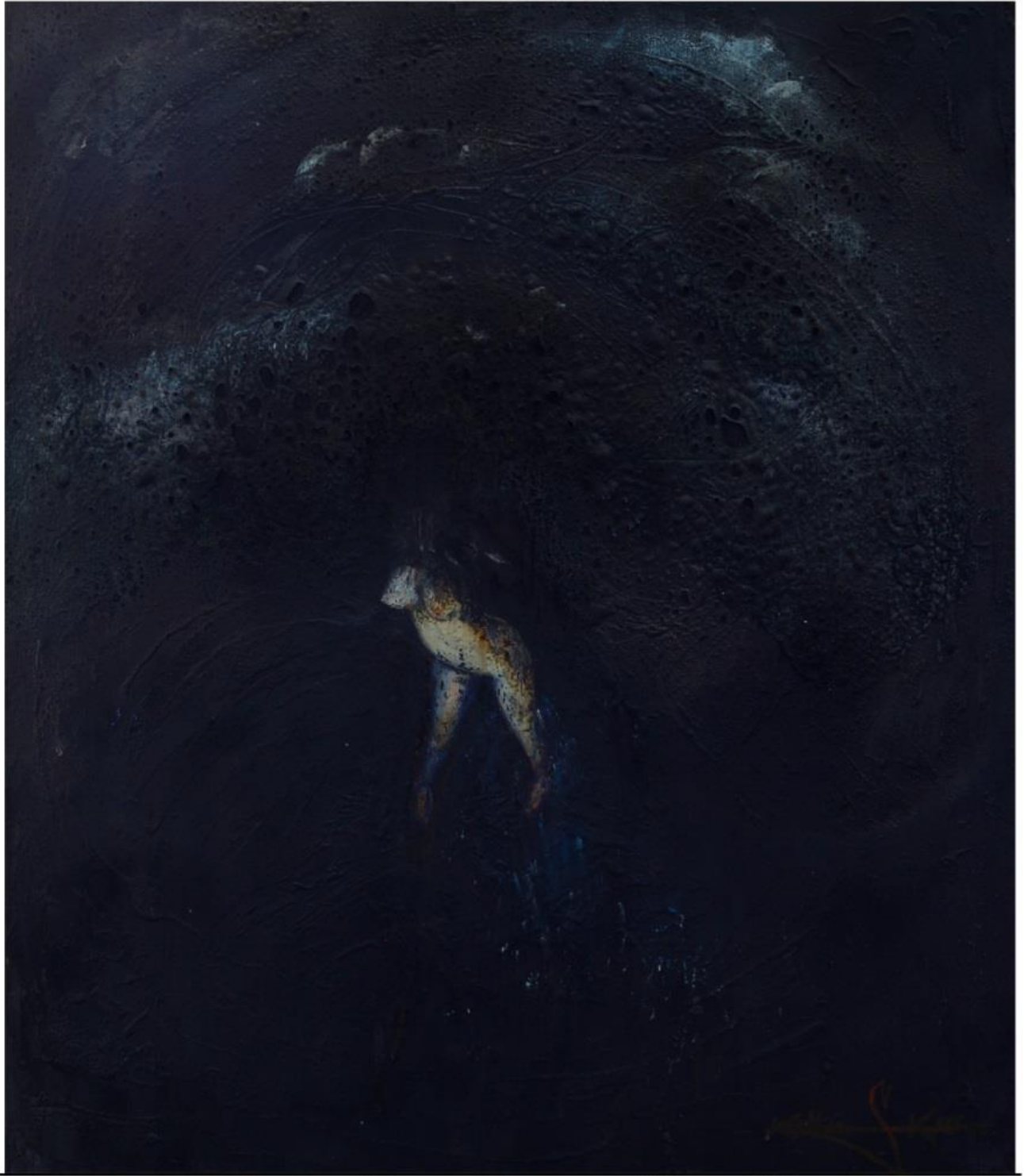
Ecstatic Conflagration - Killian Skarr 2015 oil color, tar, spraypaint, polyurethane, fire, on wood panel 26.5"x22" (copyright 2015) killianskarr.com