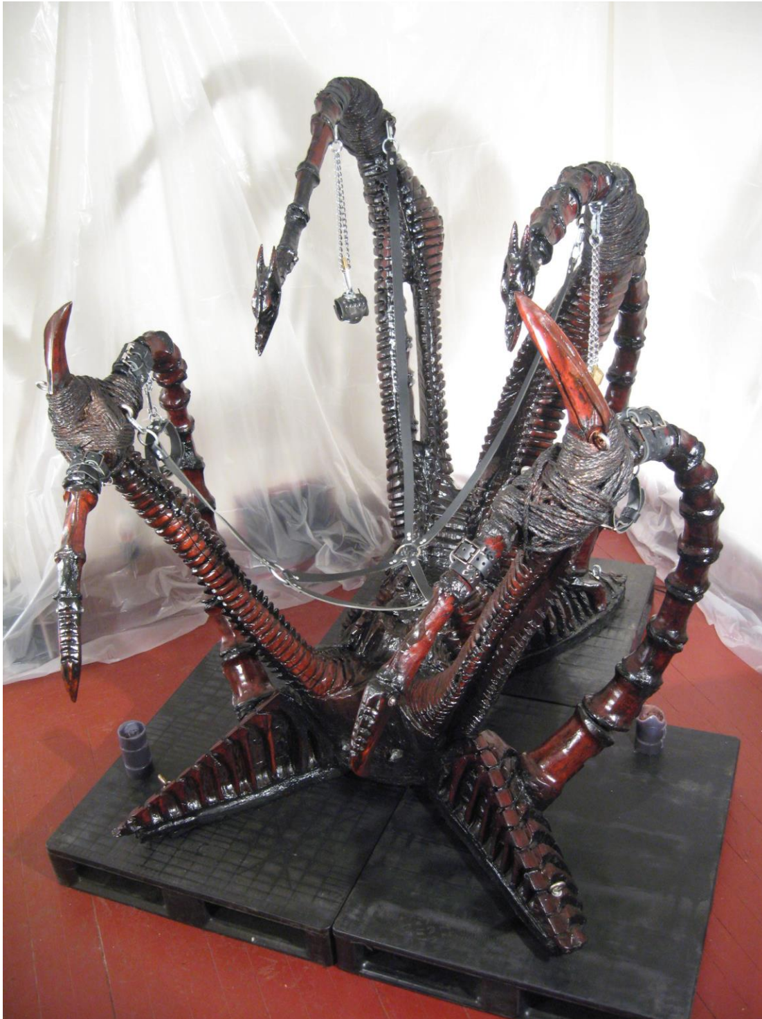
Nihilophilic Cuddlebunny Wood, Hardware, Leather 80"x66"x52" 2009