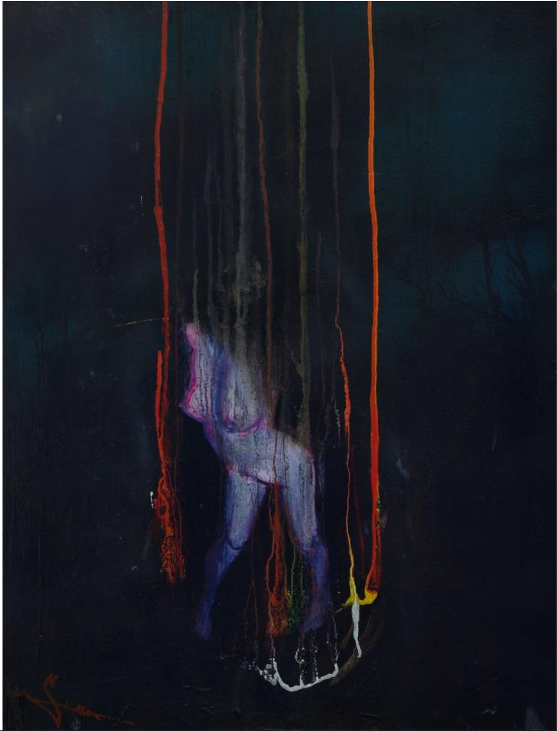
Ecstatic Conflagration-2 - Killian Skarr 2015 oil, color, tar, spraypaint, tattoo ink, fire on wood panel 29.5" x 22" (copyright 2015) killianskarr.com