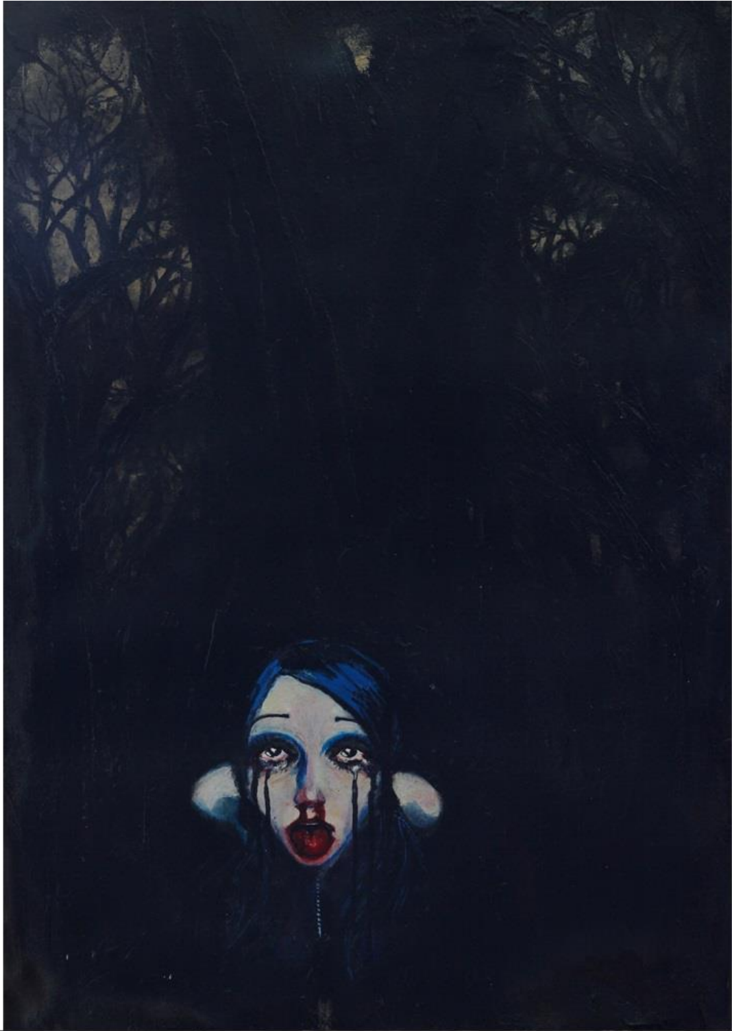
Midnight Communion - Killian Skarr 2015 oil color, tar, spraypaint, tattoo ink, polyurethane, resin, blood, semen, fire on wood panel 30 x 22 (copyright 2015) killianskarr.com