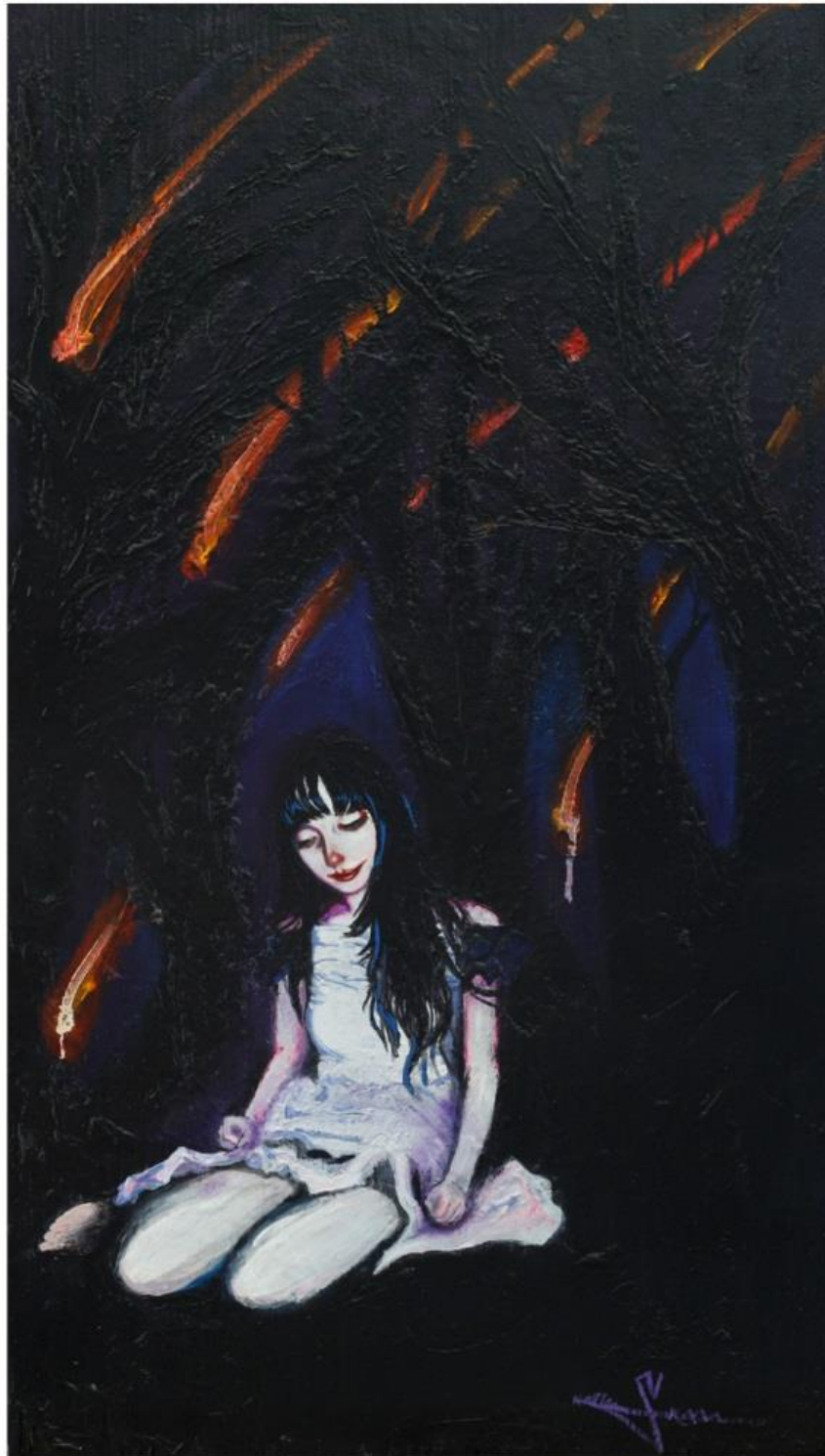
Acquiescence - Killian Skarr 2015 oil color, tar, spraypaint, tattoo ink, resin, fire on wood panel 25.5" x 15" (copyright 2015) killianskarr.com