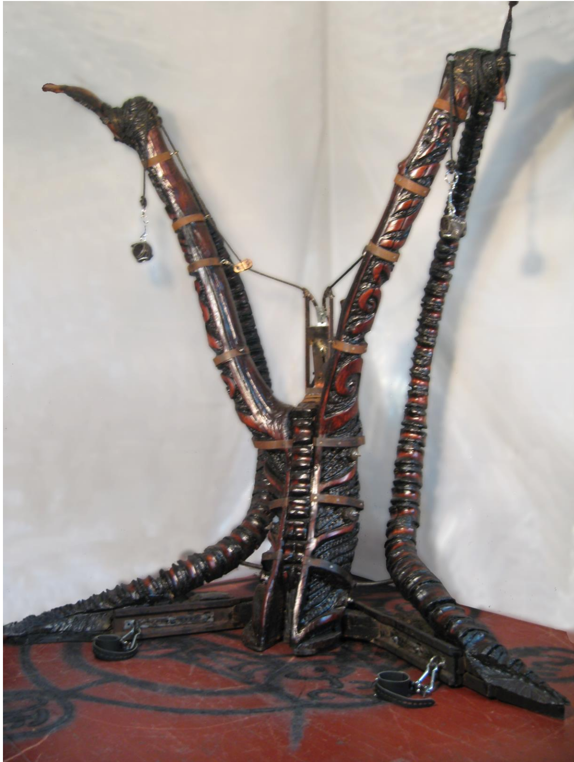
Trans-teleological Tuggy-Bear Wood, Metal, Found Hardware, Bone, Leather 7.5'x6.5'x5' 2010