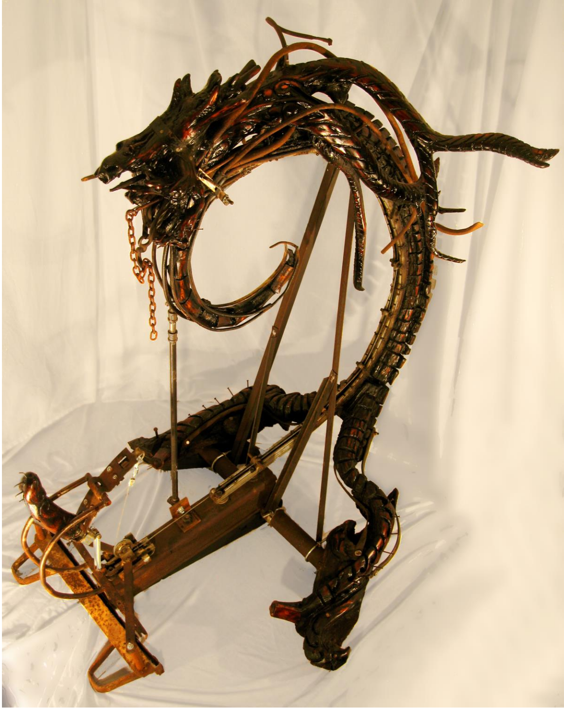
Post-solipsistical Smoochy-pie Wood, Metal, Bone, Leather 6'x7'x3.5' 2011