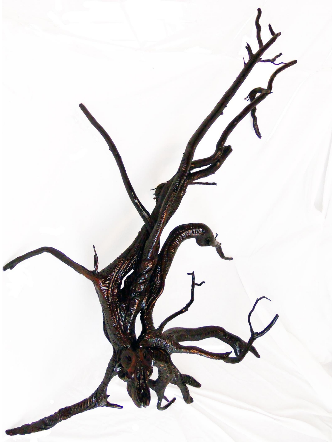
Capra Satanicus Hircus no.3 Wood, Metal 72"x48"x32" 2013