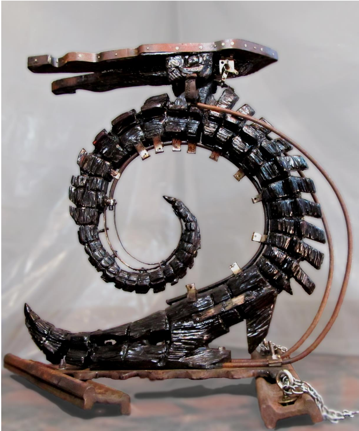
Anti-anthropocentrism Bitey-Boo Wood, Metal, Leather 42"x42"x12" 2010