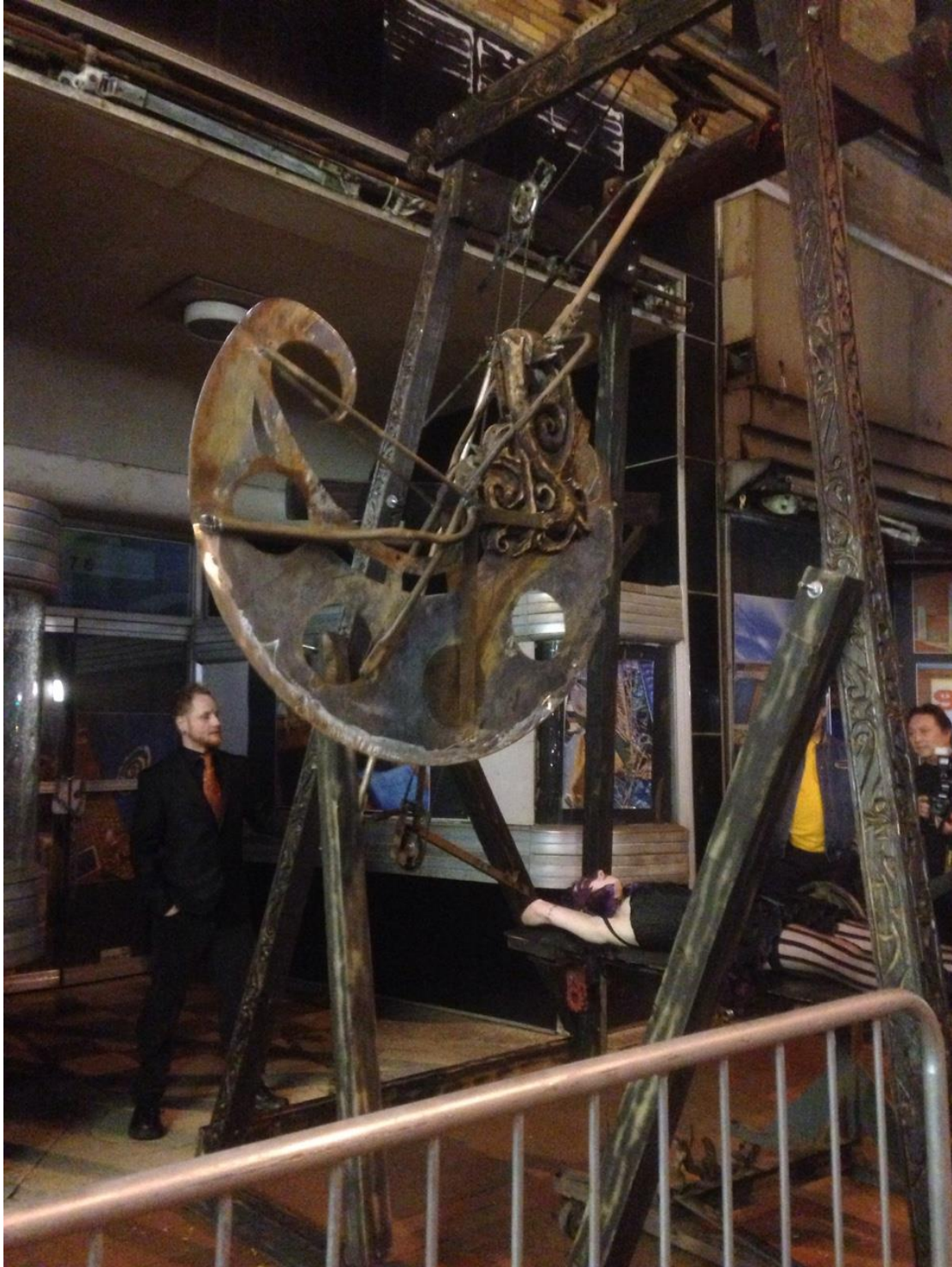
The Pendulum Kinetic Sculpture commissioned for "the Masque of the Red Death" masquerade ball at the Akron Civic Theatre, 2014 approx. 14'x 14'x10'