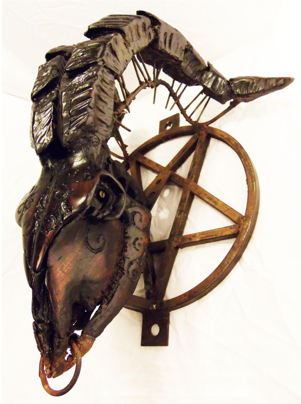
Capra Satanicus Hircus no.2 Wood, Metal 52"x38"x32" 2013